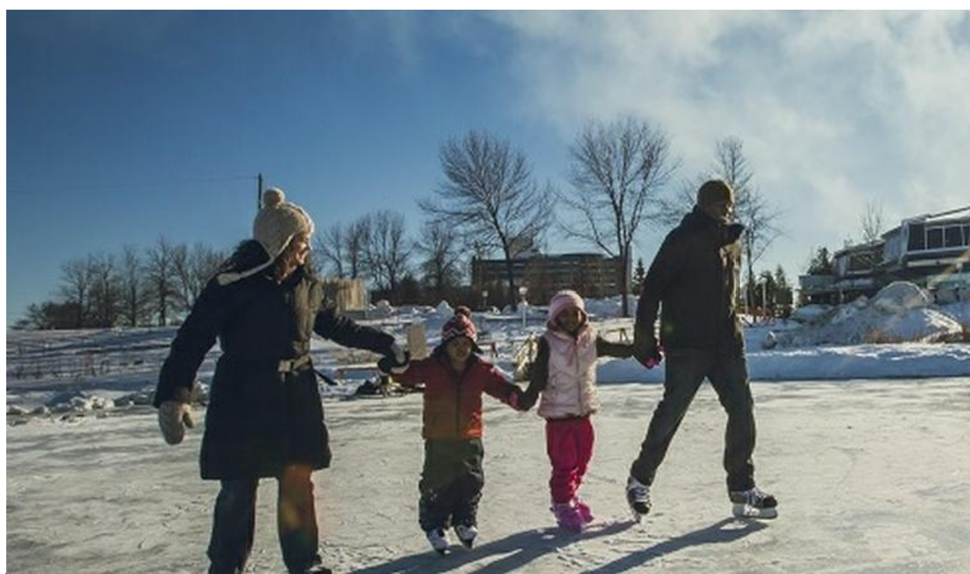
COMMUNITY RUN ICE RINK