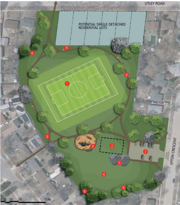
City of Mississauga plan (SK1) of the former Willow Glen Public School site.