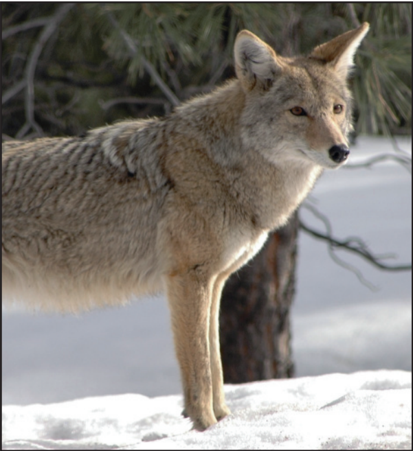
Coyotes are attracted to areas looking for rodents and rabbits to hunt and are mostly shy of humans.

Mississauga Animal Services can be contacted on evenings, weekends and holidays at (905) 615-3000 to report unusual wildlife activity.