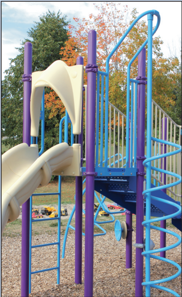
The Hillside Park renovation finished midsummer and includes all new playground equipment.