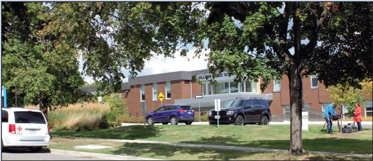
A CBC News Network reporter finishes her live coverage of an education announcement at Hillside P.S.